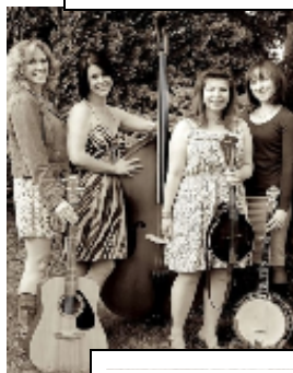
Sweet Yonder (Sat)