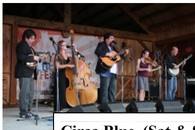
Circa Blue (Sat & Sun)