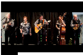
Hickory Hill (Sat)

Thursday Kick Off Jam ! Friday Band Draw $ 1000 CASH PRIZE