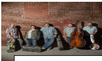
Blue Mafia (Sat)