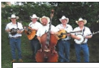
Bluegrass Brothers (Sat)

Book Early for the Festival Room Rate * (855) 373- 8577