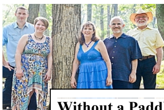
Without a Paddle (Fri)